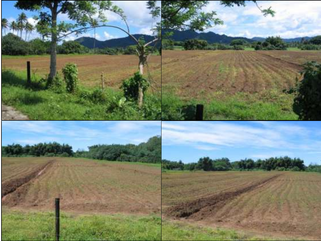
Figure 6: Commercial ginger production in Navua.