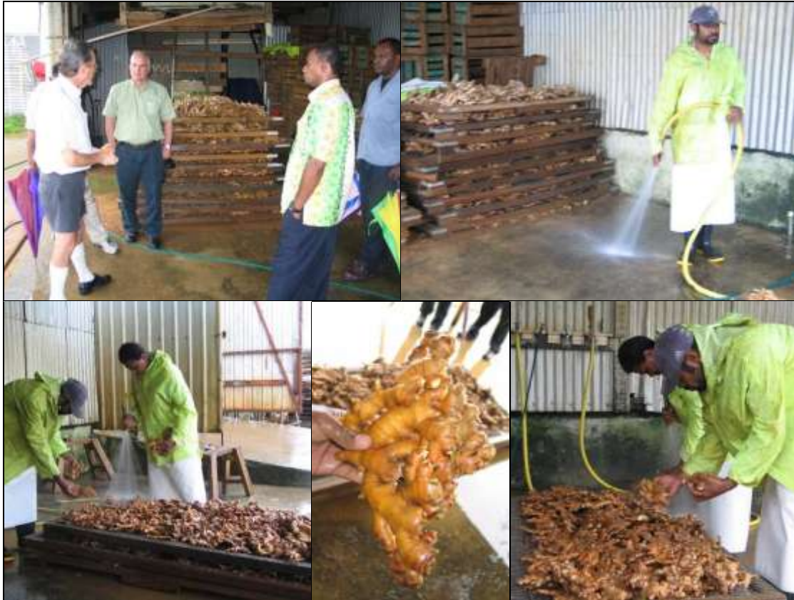
Figure 9: Ginger rhizomes being washed and inspected

The ginger rhizomes are washed individually using a high pressure hose to remove soil and external contaminants (Figure 9). The ginger rhizomes are then transferred on the wire mesh to another area where they are left for about 14 days to dry (Figure 10).