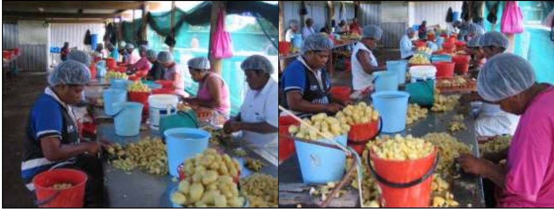
Peeling and cutting of ginger rhizomes for exports