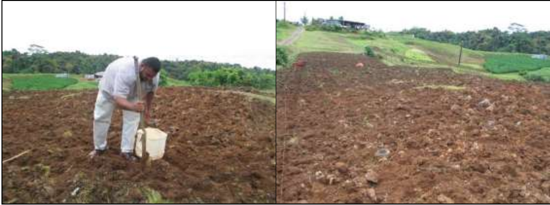
Figure 4: Extension Officer demonstrating the planting operation

The seed material is packed in onions bags to facilitate heat penetration and effective treatment of all seed material (Figure 5). However, since the cessation of government assistance, which supplied gas for the hot water treatment, and the absence of any diseases affecting the planting material, some farmers have by-passed this process due to costs.