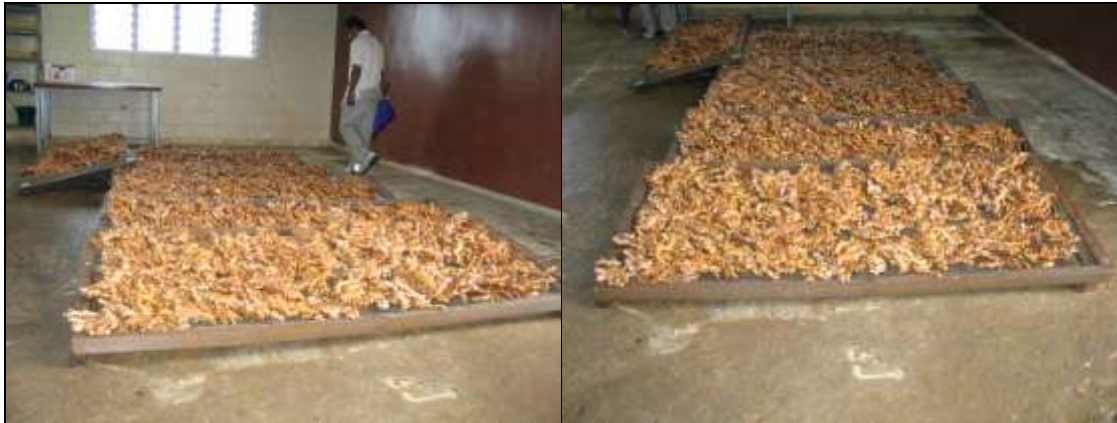
Figure 10: Washed ginger being left to dry prior to further inspection and preparation for export