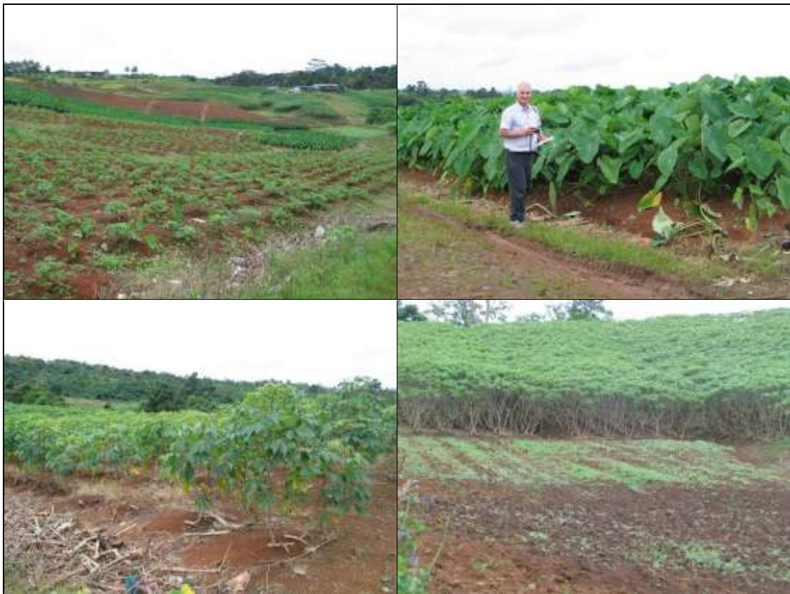
Figure 3: Ginger cropped in rotation with taro (top) and cassava (bottom)

As indicated in Fiji's submission for ginger to Australia, the ginger seed material is subjected to a number of treatments such as dipping in hot water (51°C) for 10 minutes to address any nematodes carried on the seed material. The healthy seeds for planting are selected from material that has been left to dry for a few days. Shrivelled seed materials are discarded. Unfortunately, we were not able to observe any seed and land preparation, but we managed to visit a planting operation on a small farm (Figure 4). Ideally, the planting program should take place between August and September before the onset of the rain season.