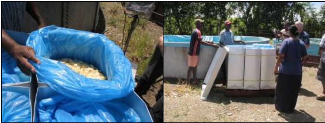
Packing for export