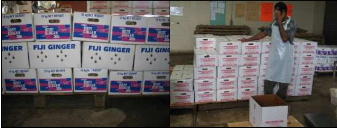
Figure 12: Adult ginger packed for export