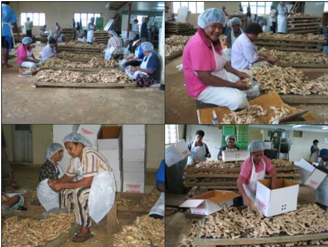
Figure 11: Adult ginger rhizomes being conditioned for export