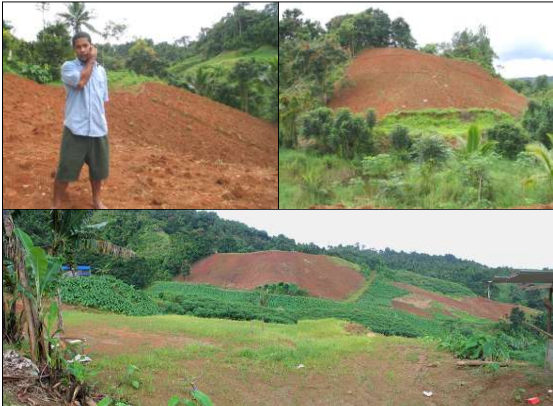
Figure 2: Ginger farms at the highlands of Naitasiri

In contrast, even with mechanised assistance, the flat land commercial farmers face a difficult task in maintaining well drained soils. Discussions with field staff during the visits to the flat land ginger areas indicated that rotting appeared to be the major problem for ginger if kept in the field to mature. This meant that ginger was harvested early (as baby ginger) for processing into products such as ginger in brine. Investigations by the staff at the Koronivia research station are ongoing to determine whether this rotting is either due to pest and disease infestation or waterlogged soil conditions.