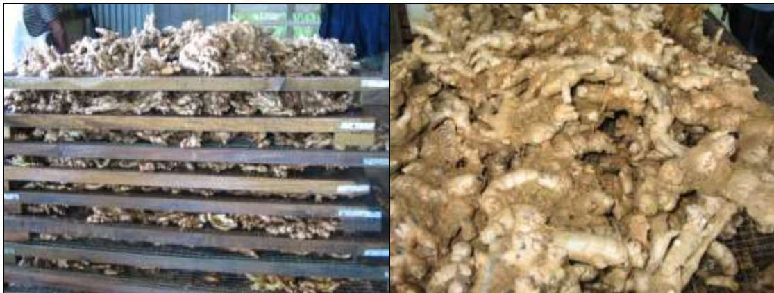
Figure 8: Adult ginger stacked for washing

Adult ginger is currently exported to New Zealand, Hawaii and other countries without additional treatments. Adult ginger for export is sourced primarily from the highlands and is transported from the field to the pack house in wooden crates. The ginger is weighed and quality assessed prior to being stacked on wire mesh for washing (Figure 8).