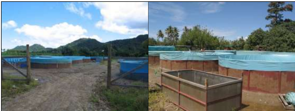
Storage tanks of baby ginger in brine solution

The baby ginger from the commercial flat land farms is processed into ginger products such as ginger in brine etc. For this process, the ginger is washed with a high pressure hose to remove soil. The rhizomes are then stored in tanks of brine solution for a few weeks prior to being peeled, sliced or diced and weighed for the final product (Figure 7).