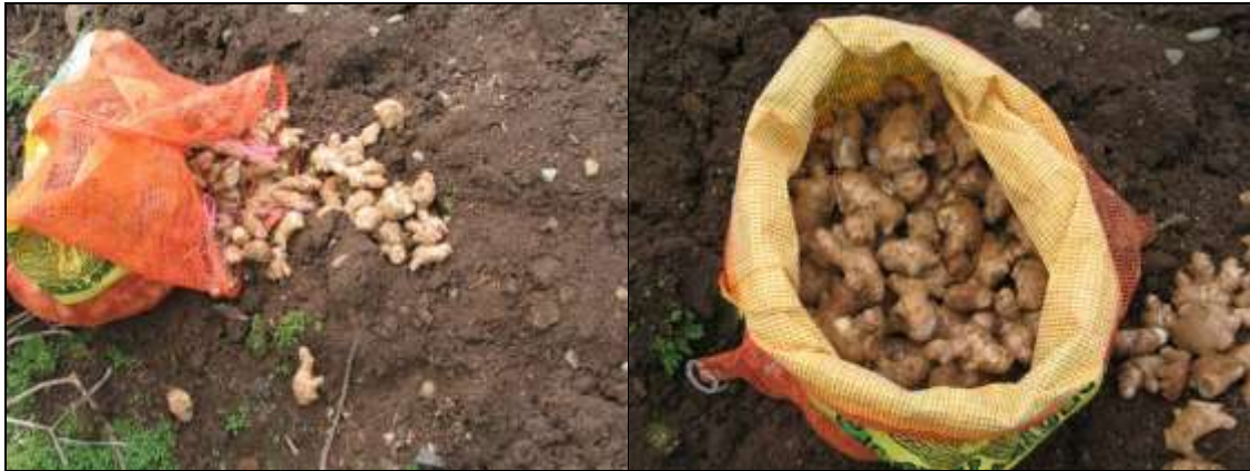
Figure 5: Seed material for planting

The seed material is packed in onions bags to facilitate heat penetration and effective treatment of all seed material (Figure 5). However, since the cessation of government assistance, which supplied gas for the hot water treatment, and the absence of any diseases affecting the planting material, some farmers have by-passed this process due to costs.