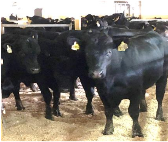
Day 1 Cattle in pen — no issue identified