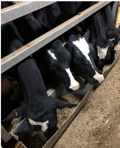
Day 18 Cattle feeding — no issues identified