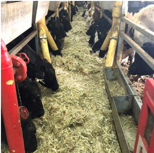
Day 6 Cattle eating roughage — no issues identified