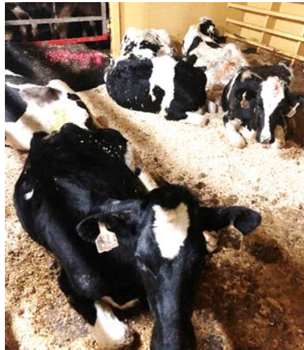
Day 13 Cattle in hospital pen — no issues identified