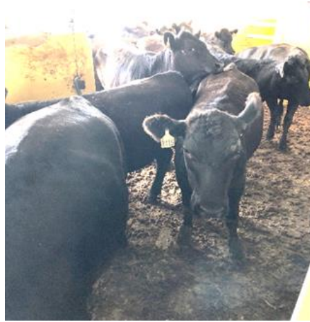
Day 8 Cattle in pen — no issues identified