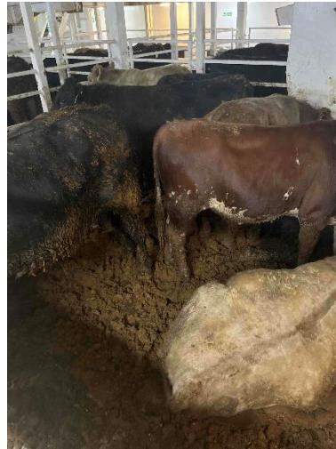
Day 7 Cattle in pen — no issues identified