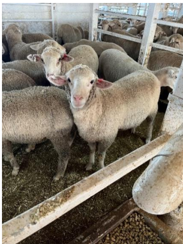
Day 22 Sheep in pen — no issues identified