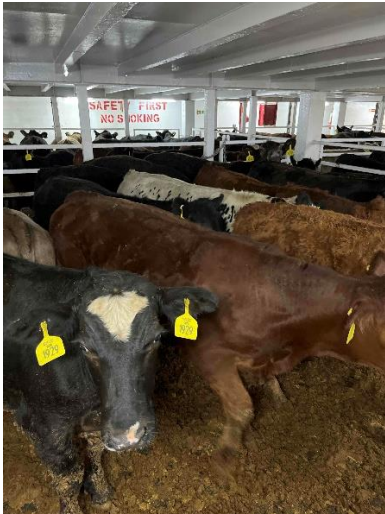
Day 2 Cattle in pen — no issues identified