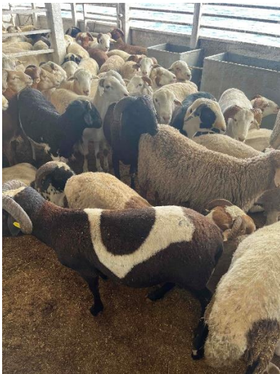
Day 12 Sheep in pen — no issues identified