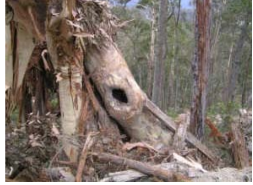
South East Forest Rescue 2009