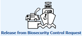
Release from Biosecurity Control Request