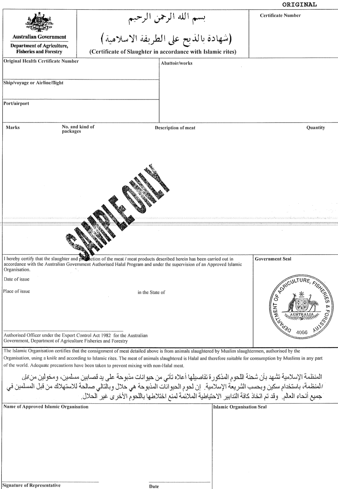
Figure 1 – EX237 Manual Halal certificate for all markets except UAE and Saudi Arabia– to be used from 21 September 2013