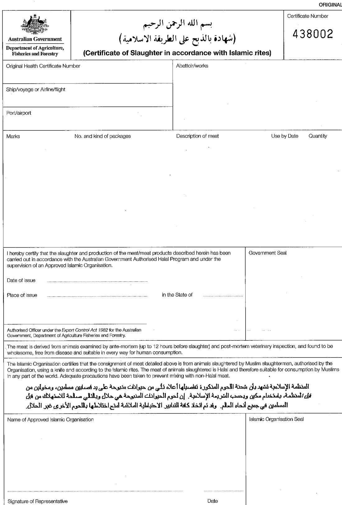
Figure 2 –EX237A – Manual Halal certificate for United Arab Emirates – to be used from 21 September 2013