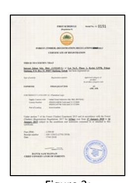
Figure 3: Exporter Registration Certificate