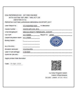
Figure 7: Export Licence (Back Page)