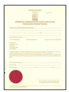
Figure 1: Registration Certificate