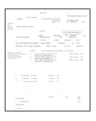
Figure 6: Export Licence (Front Page)