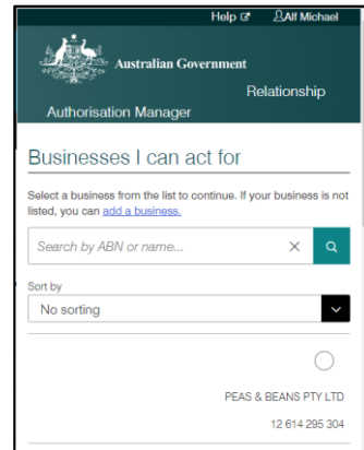
Figure 3: Select the business you are representing to lodge an inspection

Select the Direction you wish to view. Press Ctrl+P to print the Direction. Select Close to return to the previous screen.