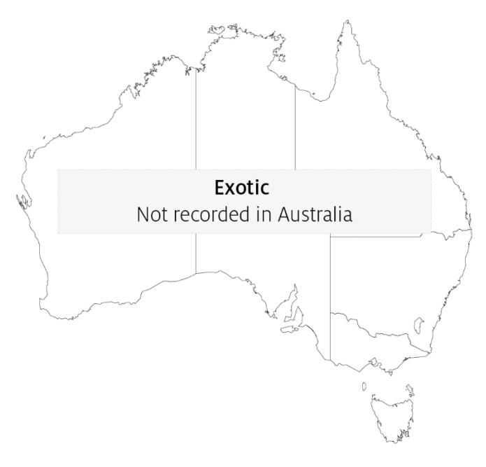
Map 1 Presence of grouper iridoviral disease, by jurisdiction

Exotic disease—not recorded in Australia.