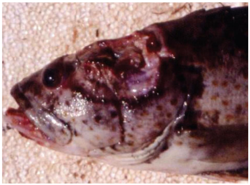
Figure 1 Gross signs of secondary infection in estuary cod ( Epinephelus tauvina ) infected by grouper iridovirus

Note: Deep ulceration in muscular tissue of the head.