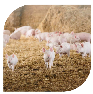
Images courtesy of Australian Fishing Enterprises (left) and Australian Pork Limited (right).