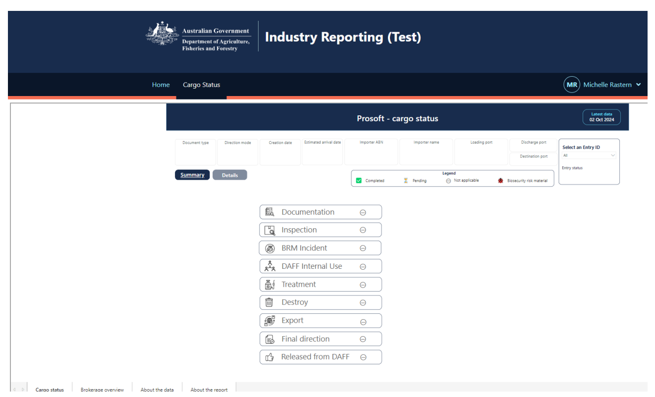
Figure 3: Accessing the Biosecurity Cargo Status Tracker report