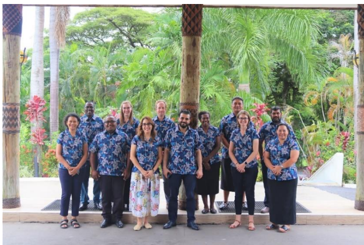
Photo 9 In Pacific style, a bula short was chosen by the Focus Group.

The International Plant Protection Convention (IPPC) community with the Commission on Phytosanitary Measures (CPM) acknowledged the importance of understanding and better managing the phytosanitary risks associated with the movement of aid in its sixteenth session (CPM-16, 2022). In this meeting, they agreed to establish a CPM Focus Group on the Safe Provision of Food and other Humanitarian Aid. Since this time, the group has worked to address its Terms of Reference virtually.