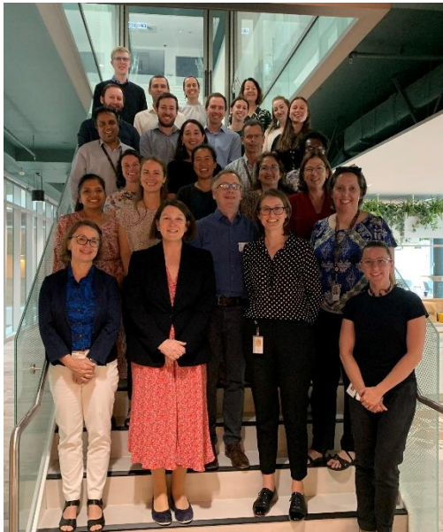
Photo 6 UK Delegation after morning tea with DAFF staff at Agriculture House.