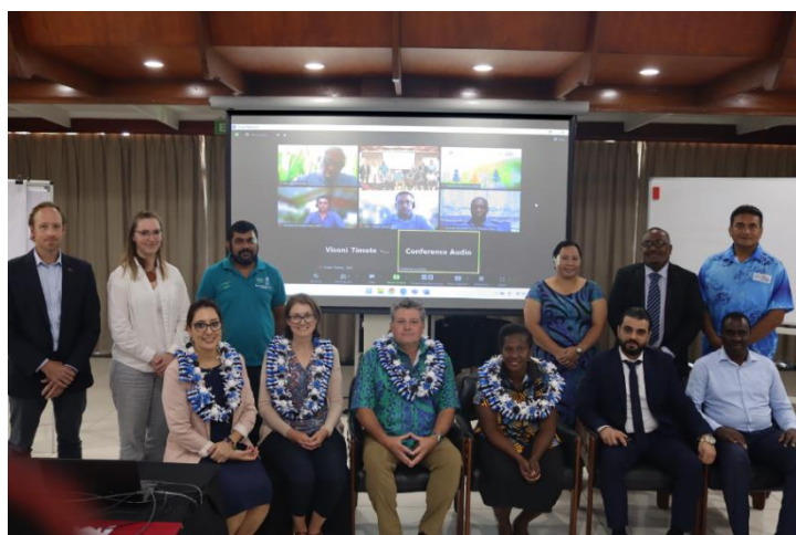
Photo 10 Focus Group members and online attendees at the commencement of the meeting.

The Focus Group considered several papers submitted to support deliberations as it worked to understand the aid supply chain and the pathways that it incorporates. It also worked to articulate this system and address concerns that raised by members of the IPPC community about the proposal for a standard to support address of this issue.