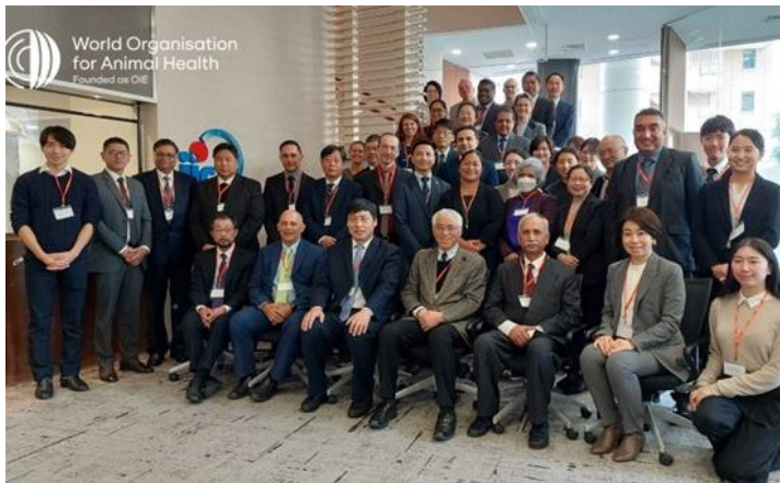
Photo 2 The Global Framework for the Progressive Control of Transboundary Animal Diseases (meeting participants in Tokyo.).

The Chief Veterinary Office participated in the 12th Regional Steering Committee Meeting of the Global Framework for the Progressive Control of Transboundary Animal Diseases in Tokyo from 7-8 February. This is a coordinating mechanism and joint initiative of the WOAHA and the FAO. A key focus of the meeting was progressing an Asia and Pacific Regional Strategy (2023-2027) for the control of priority animal diseases which include Foot-and-Mouth disease, Avian Influenza and African Swine Fever amongst others. The meeting saw agreement on the inclusion of Lumpy Skin Disease onto the list of priority diseases for the region, which will result in greater regional coordination and effort in addressing the control and spread of this significant disease of cattle which has moved closer to Australia's borders.