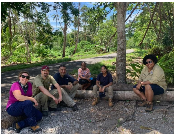
Photo 4 OCVO collaboration with SPC in the Solomon Islands.

The Chief Veterinary Office's Pacific Engagement Program for Animal Health has been preparing for Pacific Week of Agriculture being held in Fiji from 6 to 10 March 2023. The team has collaborated closely with the department's Trade, Market Access and International Division, the Pacific Community (SPC), and the FAO Subregional Office for the Pacific Islands. The team has supported coordination of an International Women's Day breakfast, and a One Health side-event hosted by SPC.