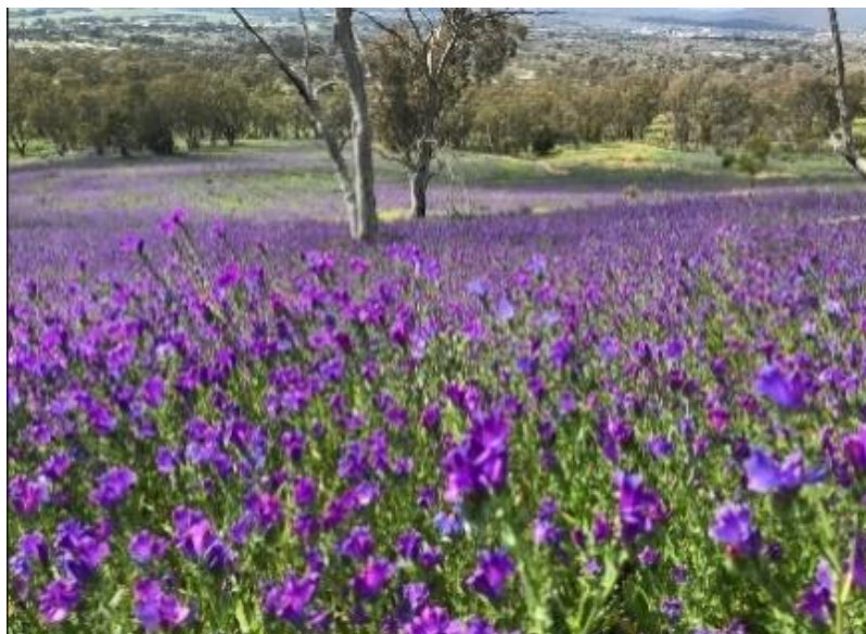
Photo 14 Reports of weed impacts on agricultural properties were down in 2019 across all impact types. Paterson's curse, pictured, is just one example.

Previous survey results are available at