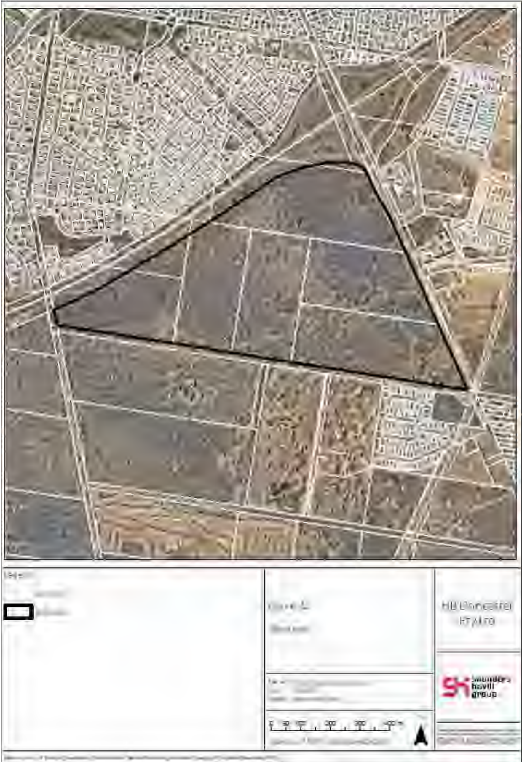
Attachment A: Site aerial of development area , as delineated by the black line.