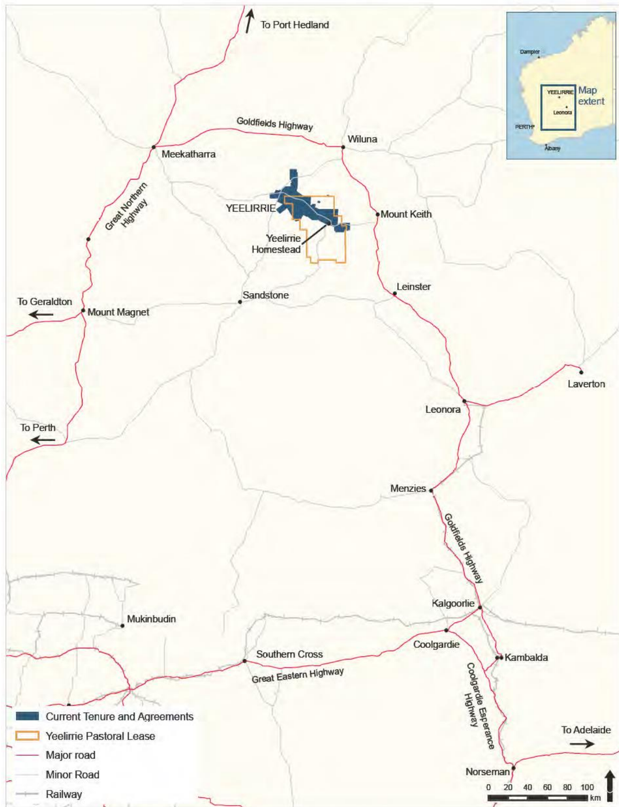
Figure 1 Location of the proposed Yeelirrie uranium mine in a regional context