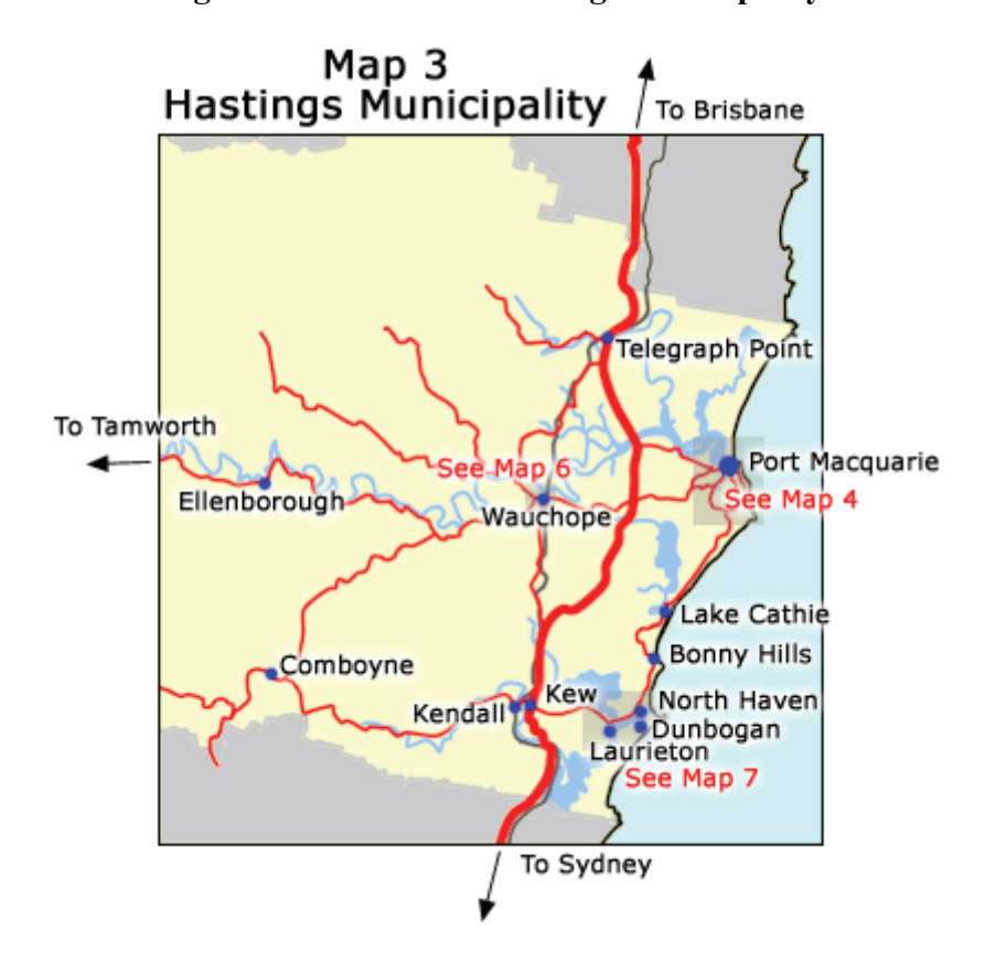
Figure 3: Location of Hastings Municipality

All potentially impacted fishers and their families lived within three Statistical Local Areas (SLAs)12 – the Hastings Part A, Hastings Part B, and Greater Taree SLAs. The Hastings Part A & B SLAs cover the area shown in yellow on Figure * below, with Hastings Parts A covering Port Macquarie, and Hastings – Part B the remainder of the area. The Greater Taree SLA is located directly south and potentially impacted fishers in that area live mostly in the coastal area bordering the Hastings – Part B SLA.