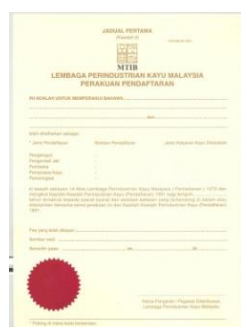
Figure 1: Registration Certificate